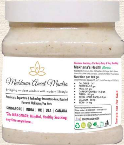
Makhana Powder/Wheat Mixed Flour