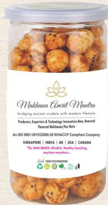
Roasted & Flavored Fox Nuts/Makhanas